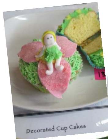
Decorated Cup Cakes