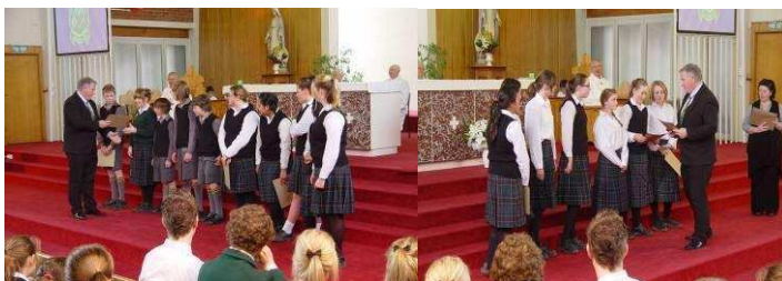
Students receiving their awards at the conclusion of Patronal Day Mass